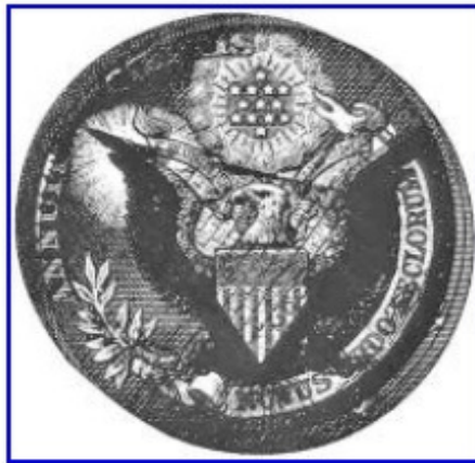
the eagle's shield is positioned in the corner of the pyramid the tip of his wing ends precisely at the end of the illumined light. This shows a very careful design.